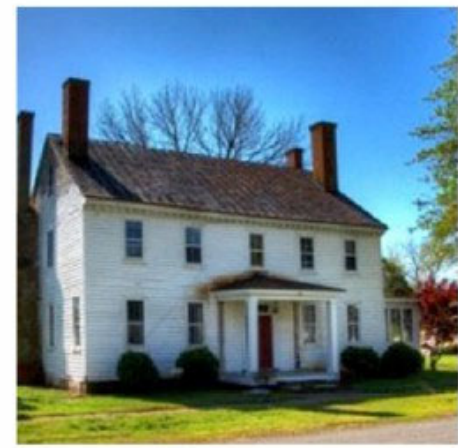
The Fox Tavern, a bit mor recent!