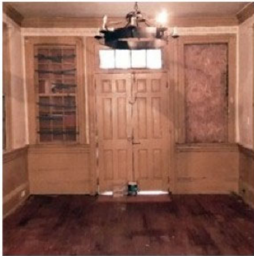
Six-panel door entrance at the rear of the central hall.